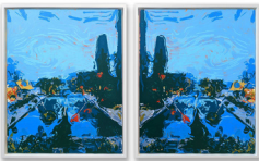
RN1465 The Pool, La Colombe d'Or Robot Painting Diptych , Painting time: 29:56:45, Stroke count: 9,208, 1 - 4 August 2022 Acrylic on wooden board, framed 2 parts, each 21¼ × 17¼in / 54 × 44cm £8,000 + VAT