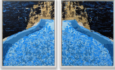
RN1461 Hotel du Cap-Eden-Roc Robot Painting Diptych , Painting time: 34:14:35, Stroke count: 13,694, 23 - 26 July 2022 Acrylic on wooden board, framed 2 parts, each 21¼ × 17¼in / 54 × 44cm £8,000 + VAT