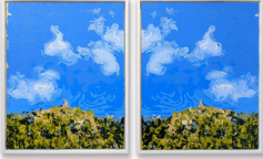
RN1464 Saint-Paul de Vence Robot Painting Diptych , Painting time: 23:52:59, Stroke count: 11,762, 9 - 11 August 2022 Acrylic on wooden board, framed 2 parts, each 21¼ × 17¼in / 54 × 44cm £8,000 + VAT