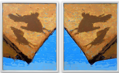
RN1462 Doves, Le Mas de Pierre Robot Painting Diptych , Painting time: 20:43:19, Stroke count: 6,574, 27 - 31 August 2022 Acrylic on wooden board, framed 2 parts, each 21¼ × 17¼in / 54 × 44cm £8,000 + VAT